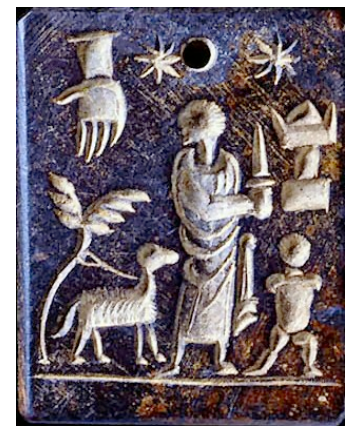
Aramaic Amulet from collection of Shlomo Moussaieff